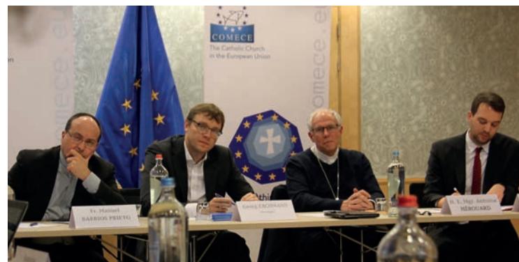
Participants and guests of the COMECE Social Affairs Commission. Brussels, 20-21 November 2019.