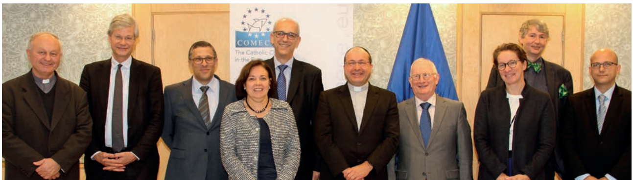
The COMECE Assembly of the Working group on Ethics gathered to exchange on national developments in the field of ethics and on the recently published reflections on "Robotisation of Life" and "Uncrewed armed systems" . Brussels, 7 October 2019.

During the Autumn 2019 COMECE Assembly, EU Bishops discussed the use of new genetic technologies and highlighted the urgency for clear regulation of the legal and ethical frameworks in all EU Member States, and also called on the EU to join an international moratorium against research intervening into the human germline, which would be heritable.