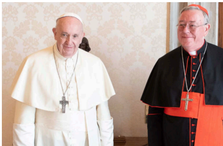
The COMECE President is created Cardinal by Pope Francis during the Consistory held at St. Peter's Basilica, Rome, on 5 October 2019.

This process also gave the input for a new political agenda aiming at democratising Europe by reducing distance with its citizens, shaping eco-friendly and youth-empowerment policies and preparing our societies for the ongoing processes of digitalisation and robotisation.