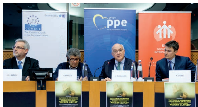
Event on countering Trafficking in Human Beings held at the European Parliament by COMECE and Don Bosco International with the participation of MEPs from various political groups. The event was organised five years after the joint Declaration of religious leaders against modern slavery. Brussels, 2 December 2019.

In order to share experiences and propose ways to enhance the fight against human trafficking, COMECE gave its contribution at the conference on Trafficking in Human Beings organized by the Migrants and Refugees Section of the Dicastery for Promoting Integral Human Development (8-11 April 2019).