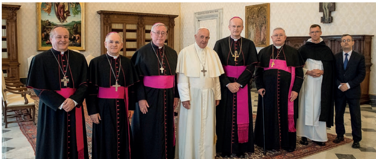
Following the May 2019 elections of the European Parliament, the COMECE Standing Committee is received by Pope Francis. Vatican City 6 June 2019 (Photo: L'Osservatore Romano).