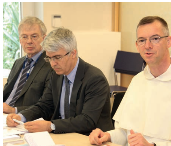
First EU-Church expert meeting on the General Data Protection Regulation (GDPR). Brussels, 21 May 2019.

In this regard, COMECE provided concrete examples of good practices coming from EU Member states (e.g. specific funds and Church/law enforcement cooperation). The Commission was also encouraged to address this matter through a cross-cutting approach, going beyond an exclusive focus on fight against terrorism.