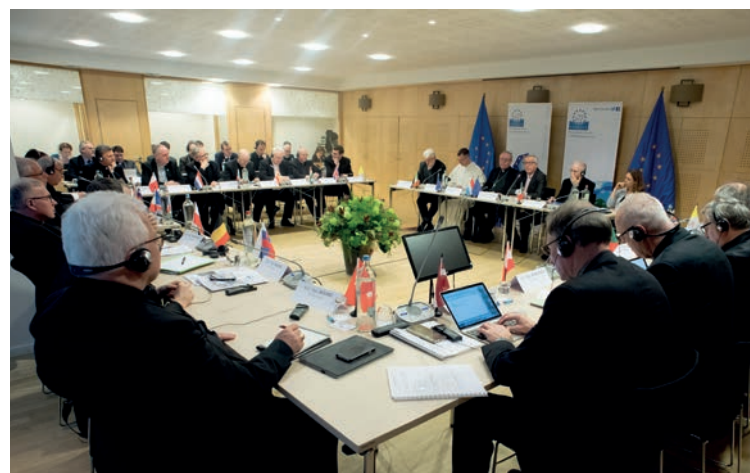
EU Bishops in dialogue with Jean-Claude Juncker, President of the European Commission. Brussels, 14 March 2019.