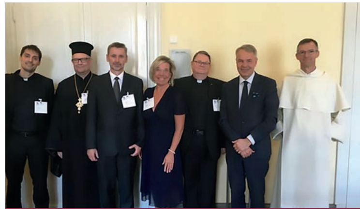
COMECE-CEC delegation meets with Pekka Haavisto, Finnish Minister of Foreign Affairs, in the context of Finland's EU Council Presidency. Helsinki, 12 July 2019.

An ecumenical delegation composed of representatives from COMECE and CEC met in Helsinki on 12 July 2019 with Mr. Pekka Haavisto, Finnish Minister of Foreign Affairs, to share their perspectives on four of the Finnish EU Presidency's priorities: a) common values and the rule of law; b) a competitive and socially inclusive EU; c) climate action: serving integral human development; d) comprehensive security and migration.