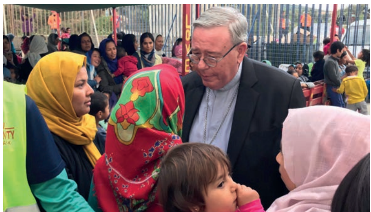
The President of COMECE was part of a Vatican delegation visiting refugees in the island of Lesbos, Greece. 8-10 October 2019.

During the event COMECE expressed the common concern among different religious denominations to work together in spiritual and practical action to eradicate trafficking in human beings, restoring dignity and freedom to the victims.