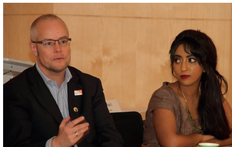
"Human Rights and Religion", event organised by COMECE, Don Bosco International and the Baha'i International Community with the participation of the EU Agency for Fundamental Rights (FRA). Brussels, 3 July 2019. (Photo: Di Maio/COMECE).