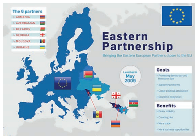
A map of the Eastern Partnership showing key challenges in EU's cooperation with its six neighbours.

Besides promoting inclusive economic processes based on production instead of predation, COMECE stressed that respective EU mechanisms need to empower the youth, women and families in their local communities. COMECE highlighted that local capacity-building through education and formation can play a key role in building a fair and just business environment.