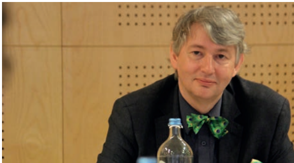
Participant of the meeting of the COMECE Working Group on Ethics. Brussels, 7 October 2019.

Due to the recent increased attention for security and defence policies in the EU and its Member States, an ethical framework for new defence technologies is needed.