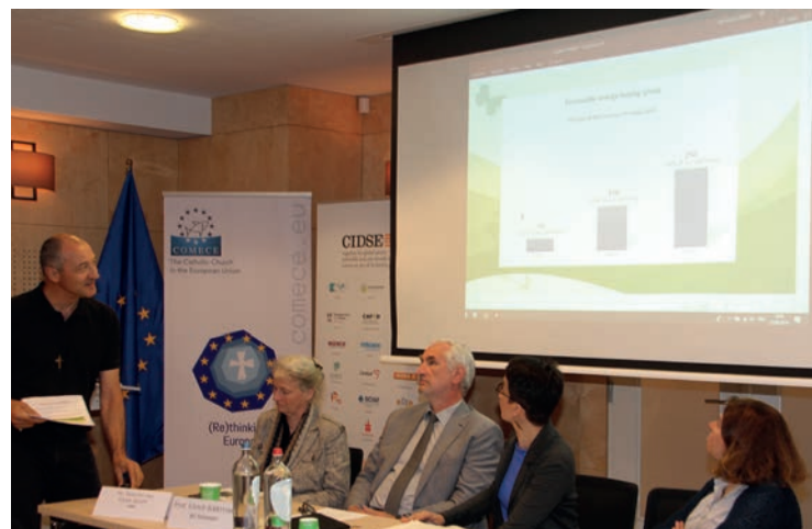
The second European Laudato Si' Reflection Day, organised by COMECE and its partners, was a call on Catholics and all people of good will to carry out a lifestyle conversation. Brussels, 12 June 2019.