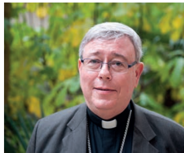
Card. Hollerich (Luxembourg)