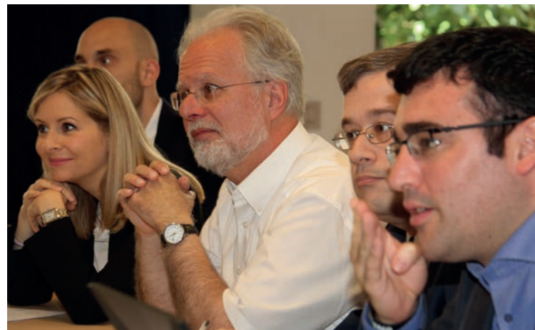
"Human Rights and Religion", event organised by COMECE, Don Bosco International and the Baha'i International Community with the participation of the EU Agency for Fundamental Rights (FRA). Brussels, 3 July 2019.