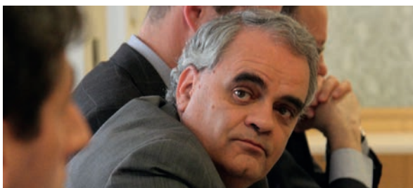
A participant of the COMECE Legal Affairs Commission during the autumn meeting. Brussels, 29 October 2019.

Dialogue event with the EU Agency for Fundamental Rights (FRA) on "Human Rights & Religion" organised together with Don Bosco International and Baha'i International Community.