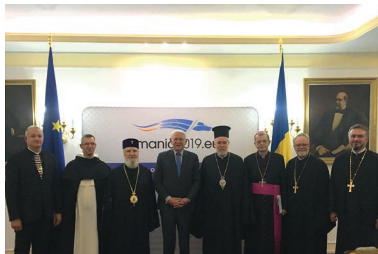
EU Churches meet with Teodor Melescanu, Romanian Minister of Foreign Affairs, in the context of the Romanian EU Presidency. Bucharest, 28 January 2019.