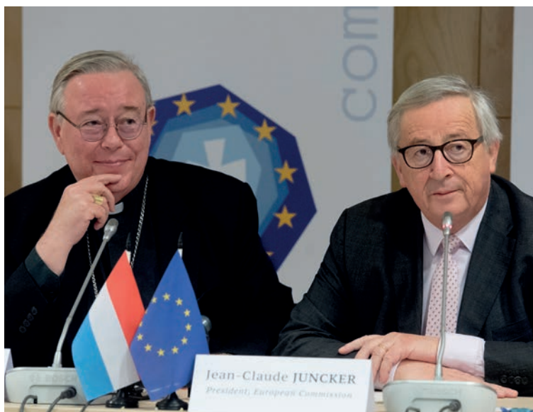
EU Commission President Jean-Claude Juncker speaking at the COMECE Spring Assembly. Brussels, 14 March 2019.

During 2019 COMECE contributed to consultations carried out by the Parliament (January-February) and the Commission (May) to take stock of the dialogue process and propose ways forward in view of the next legislature. In this context, COMECE particularly welcomed the proposal of MEP McGuinness to better involve Churches in EP Committees work.