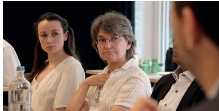
Participants of the COMECE Social Affairs Commission. Brussels, 26 June 2019.

"Tax justice and poverty" , organised with the Conferences of African and European Jesuits Provincials at the EU Representation of Bavaria with MEPs Evelyn Regner, Sven Giegold and Markus Ferber, and representatives of the European Commission, OECD and NGOs.