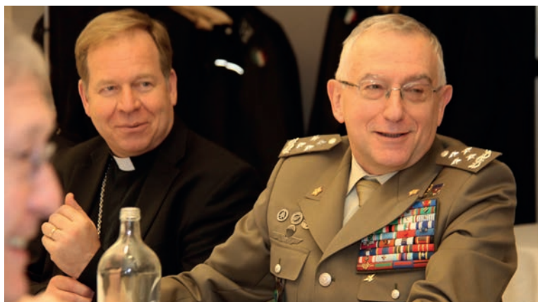
Major dialogue event between Military Bishops from across the European Union and EU military officials, including General Claudio Graziano, Chairman of the EU Military Committee. Brussels, 8 April 2019.

In the context of an increased attention to security concerns of European citizens, COMECE gathered Military Bishops from across the European Union and facilitated their dialogue with EU military officials to enhance the cooperation towards a shared strategic culture. Witnessing a loss of trust in multilateral