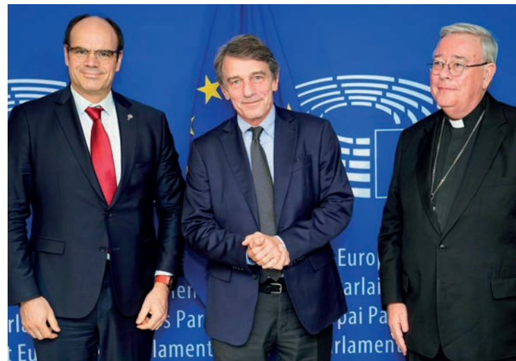
CEC and COMECE Presidents together with David Sassoli, President of the European Parliament. Brussels, 28 November 2019