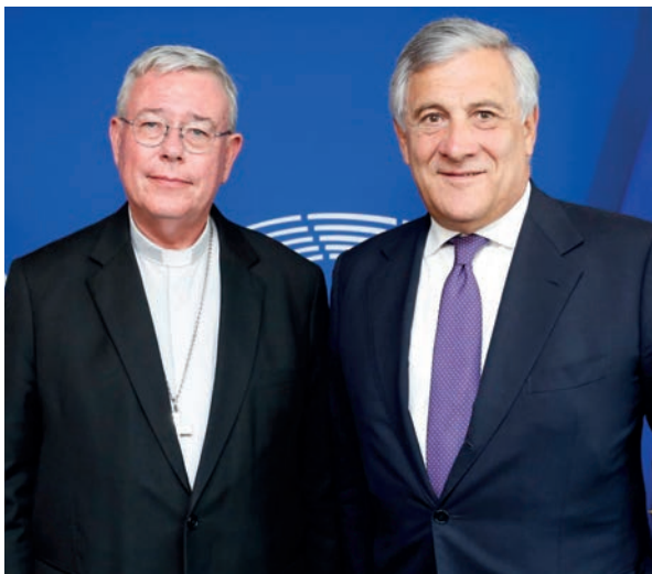
COMECE President H.E. Mgr. Hollerich meets with Antonio Tajani, President of the European Parliament. Brussels, 30 January 2019.