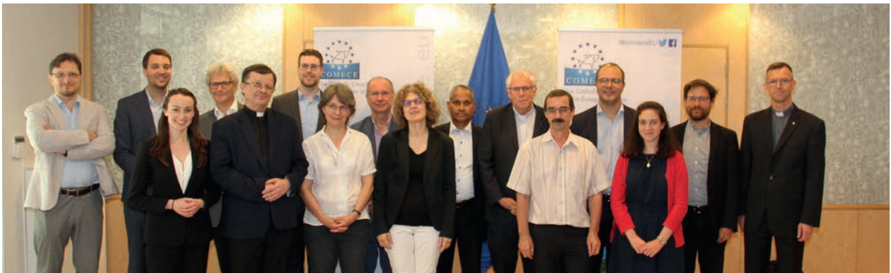
Group photo of the COMECE Social Affairs Commission. Brussels, 26 June 2019.

Through the youth platform, COMECE established a structured and regular dialogue among Christian youth movements. The platform strengthened young people's voice and underpinned COMECE advocacy on EU Youth & Education policies with their experiences, testimonies and expertise.