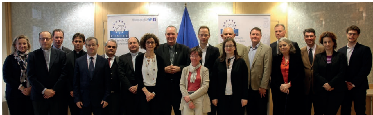
The COMECE Legal Affairs Commission. Brussels, 29 October 2019.