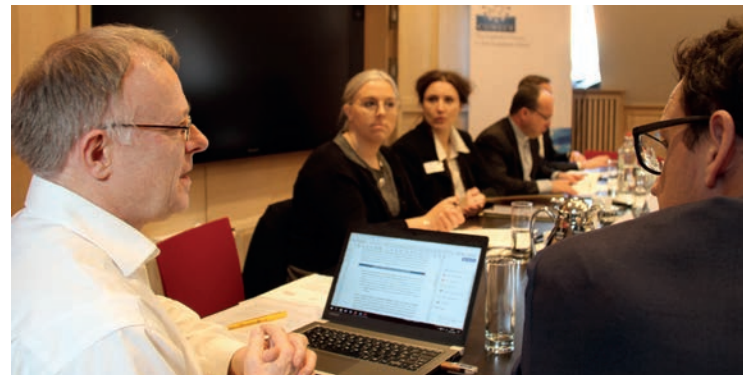
Dialogue meeting on "Tax Justice and poverty". Brussels, 11 December 2019..