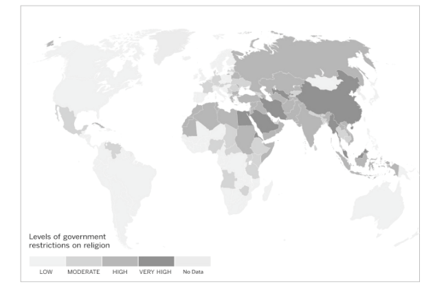
Pew Forum on Religion & Public Life • Global Restrictions on Religion, December 2009